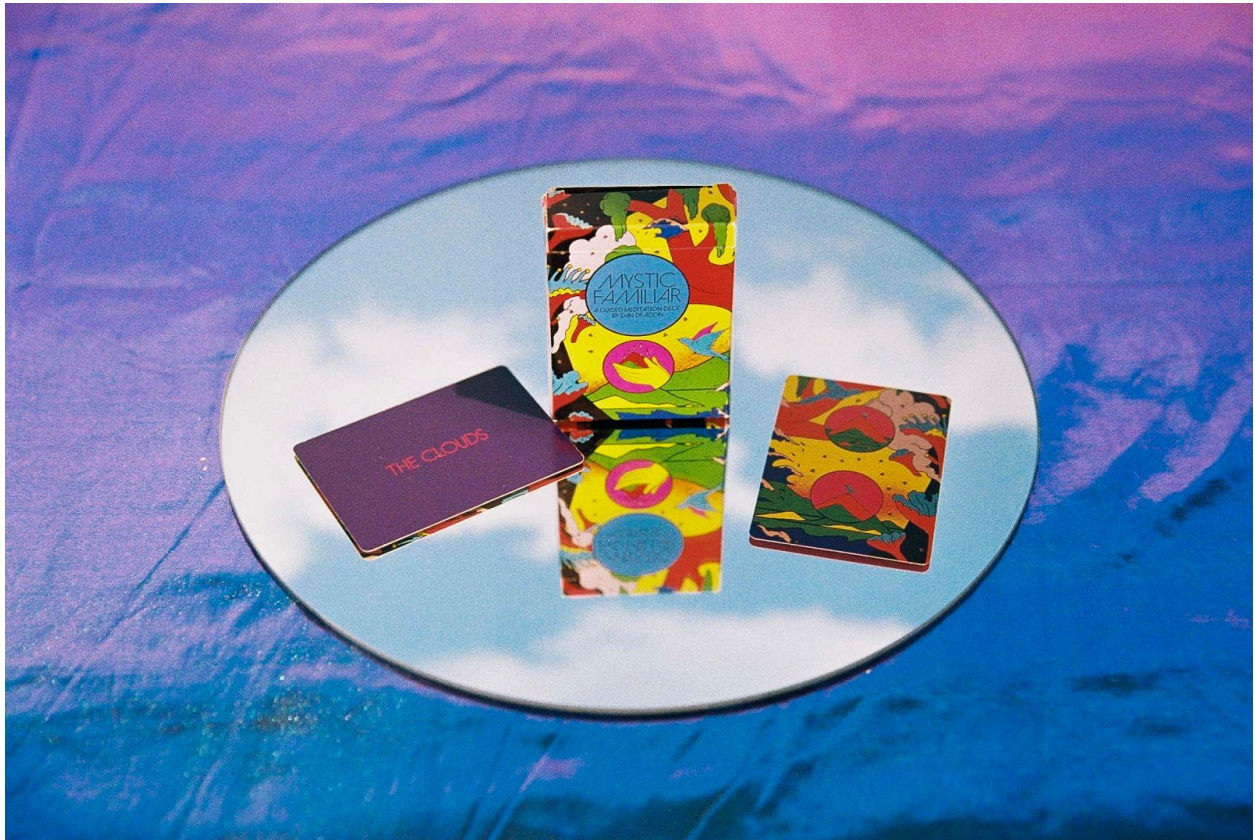
Dan Deacon's Guided Meditation Deck of Cards

Download hi-res images and jpegs of Dan Deacon - pitchperfectpr.com/dan-deacon/