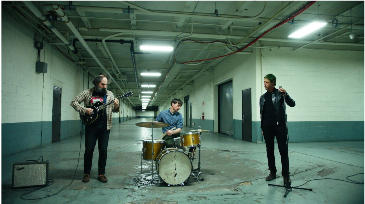
"Knuckleduster" Video Still