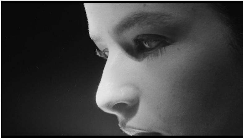
“el cielo no es de nadie” Video Still

Watch Ela Minus’ Video for “el cielo no es de nadie”