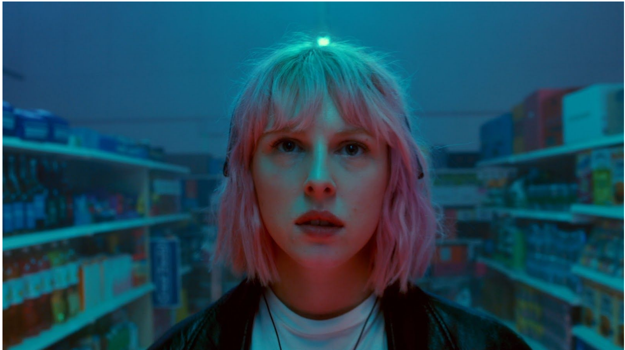
“Solipsism” Video Still

BREACH Out September 18th on Dead Oceans