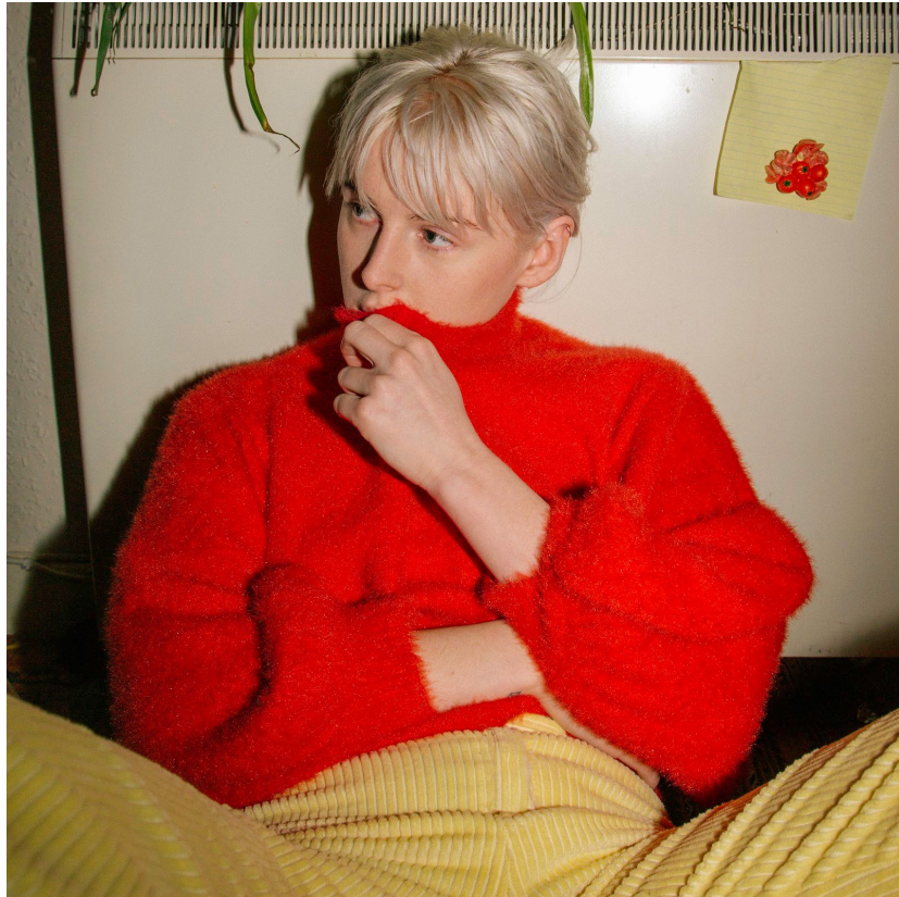
BREACH Cover Artwork

Download hi-res images and jpegs of Fenne Lily