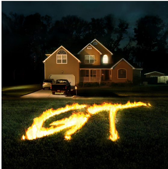
Feed The Animals Cover Artwork