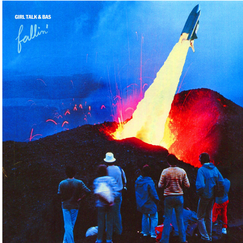
“Fallin’” Track Artwork by Andrew McGranahan

Girl Talk , aka Pittsburgh-based producer Gregg Gillis , and Bas release a new single, “Fallin’.” This is their second collaborative track, following “Outta Pocket” for Dreamville’s Revenge of the Dreamers III . “Fallin’” uses dynamic production - spacious layered synths, skittering hi-hats, and speaker-rattling 808s - to capture the haze of a late night drive. Bas’ delivery is ever-changing, jumping from rapid-fire double-time flows to spaced-out harmonies to a screwed-and-chopped breakdown.