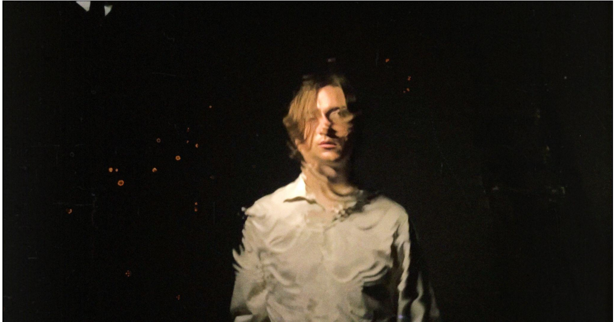
“Nothing” video still

"It's a crisp, ornate production that blooms into something immaculate and expansive by the end." - Stereogum