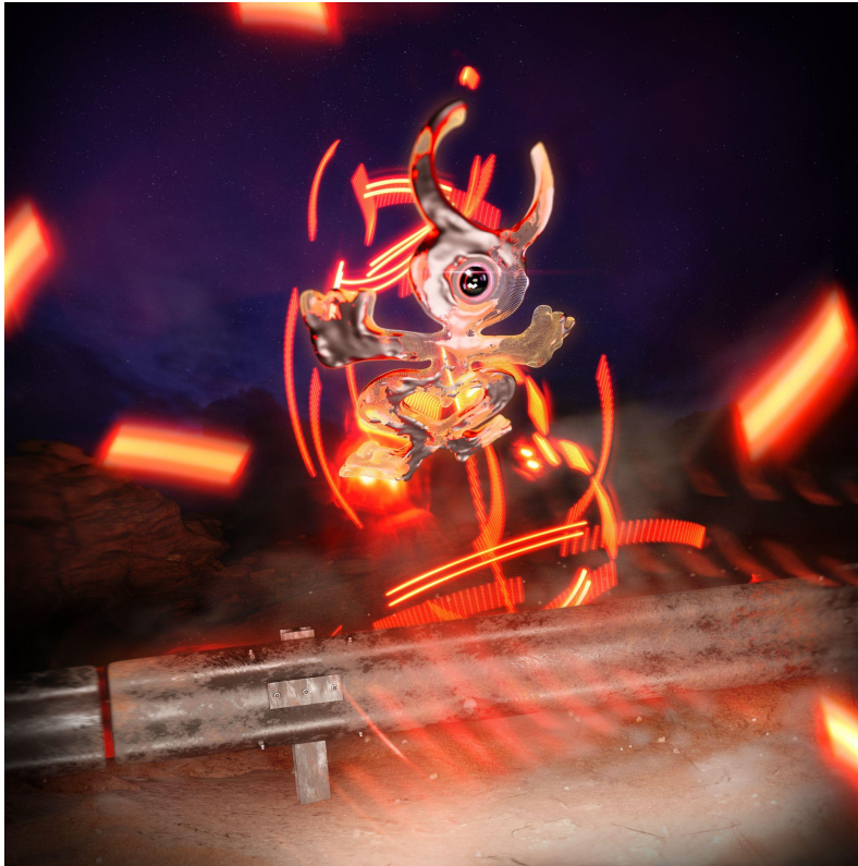
(Transmission Cover Artwork)