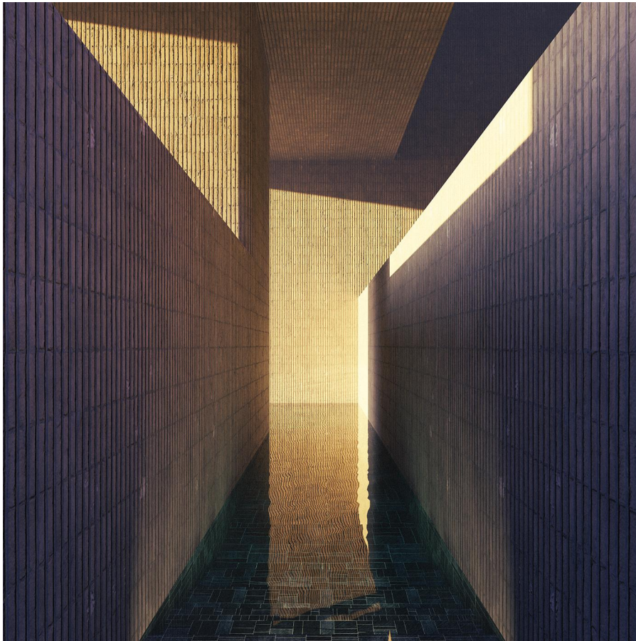
i've seen a way Cover Artwork

Download hi-res images of Mandy, Indiana