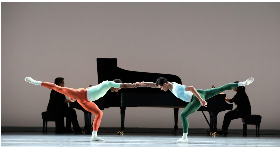
Artist of Houston Ballet